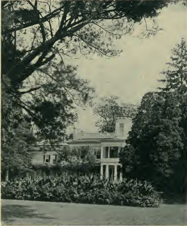
"DOUGHOREGAN MANOR," HOWARD COUNTY, MARYLAND Home of Charles Carroll

I had been face to face with the great expressions of Europe, and had talked with Vedder, with Abbey, and with others in the ateliers of the E. D. B. A. I knew the museums of Madrid, of Florence, of Paris, and of London; the streets and alleys of all of those Spanish, Italian, and French cities where architecture is at home, and where the street gamins and the proletariat are in complete accord with the architectural expressions of their fathers. With the memories of the old world fresh in my mind, and with add-